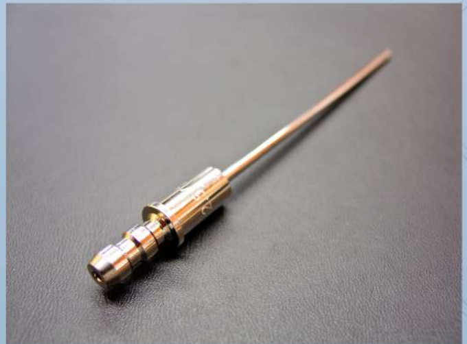
Overlook filler needle