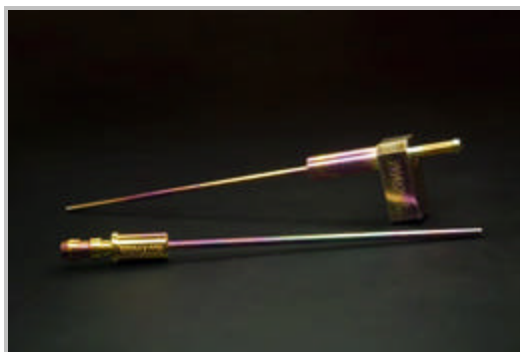
with Proprietary Coatings