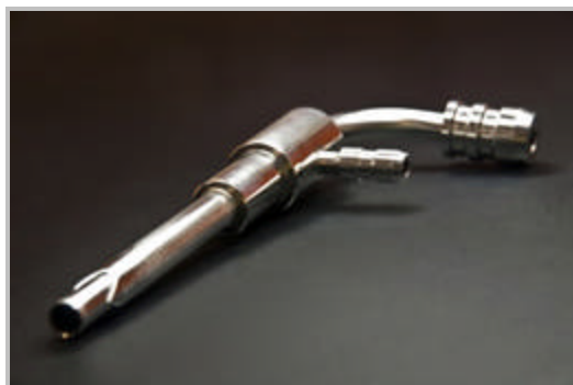
Ax Filler Needles