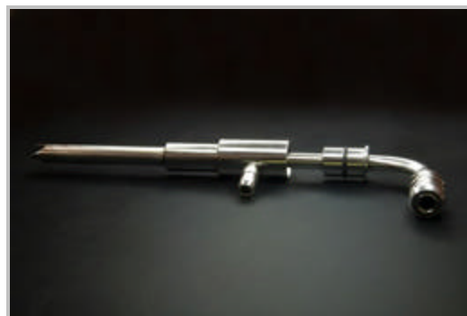
90° Co-Ax Filler Needle (Separated)