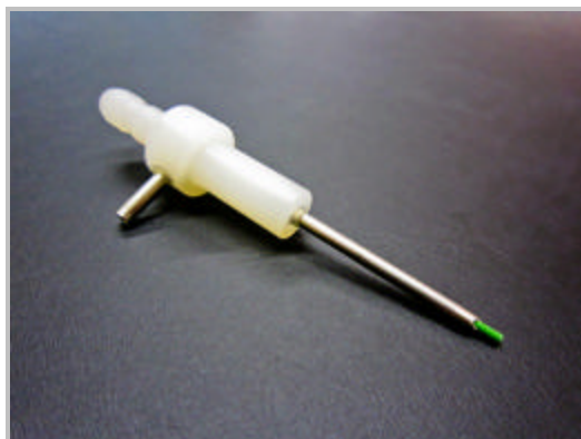
OneShot™ Coax Needle with Teflon-coated Fluid Path