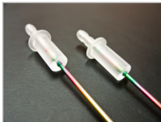
OneShot™ Needles with AMCX2286 "Rainbow" Coating