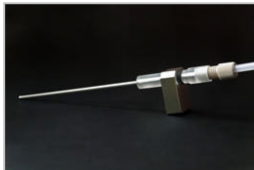
specific OneShot™ Needles