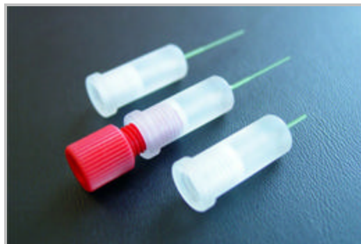
Microtips with Upchurch Fittings