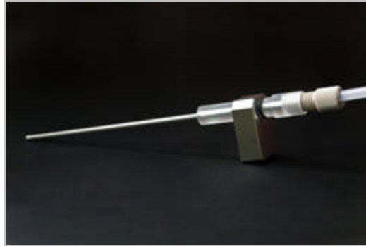
specific OneShot™ Needles