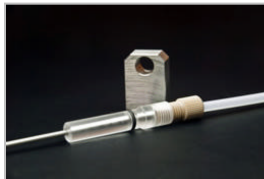
specific Change Parts