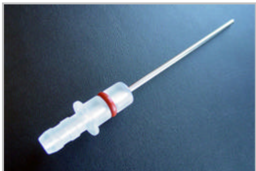
Needle with Silicone O-Ring