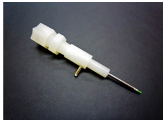
Jaco-style OneShot™ Coax Needle with Teflon- coated Fluid Path